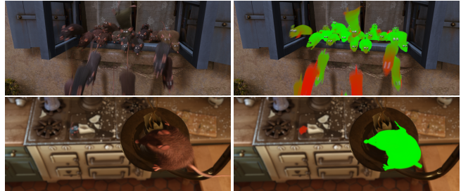
Figure 2: Motion-blur and depth-of-field measures. Red means more simplification.