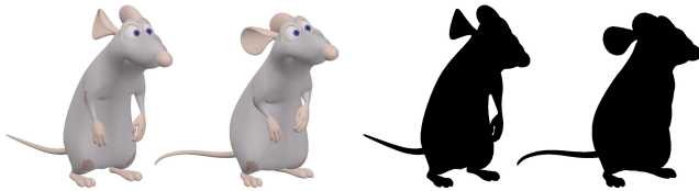
Figure 1: Complex vs. Simple silhouette.

Our rat's overall body is posed in a teardrop shape with a slight "S" shape down the spine. By lowering the center of gravity we create a soft appeal, maintain balance when the body is leaning forward and switch between biped and quadruped poses believably. When considering the body contour, we strove to keep simple direct shapes. By creating clean silhouettes and simplified forms, we retain the appealing stylized design even in extreme action. Simple shapes also help the rats feel smaller.