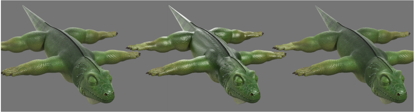
Figure 1: the left-most lizard is rendered with a shading rate of 0.01, or 100 samples in a single pixel, to simulate the overall effect of displacement to illumination. This simulates the ground truth. The middle lizard is rendered with the shading rate of 1, this is a more “normal” render for production, but note all the fine details provided by displacement is lost. The right-most lizard is also rendered with the shading rate of 1, with our “bump roughness” method, which renders quickly. Yet it also preserves the visual interest of the ground truth render.

Christophe Hery* Michael Kass† Junyi Ling‡ Technical Memo 14-04 Pixar Animation Studios