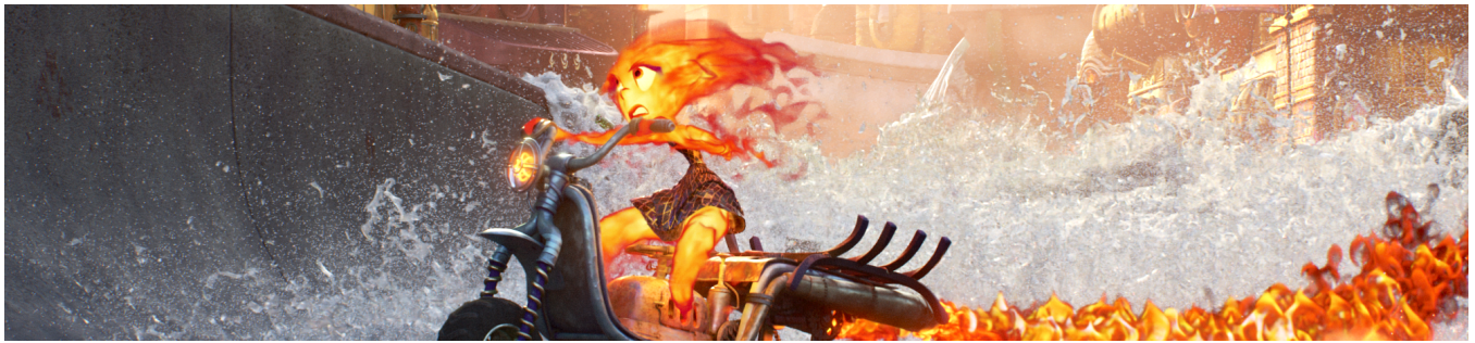
Figure 1: A scene from Elemental where NST has been applied to the character and motorcycle fire.

Jingwei Tang jingwei.tang@disneyresearch.com Disney Research Studios