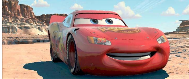
Lpics render \approx 0.1s