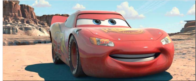
Final render \approx 2000s