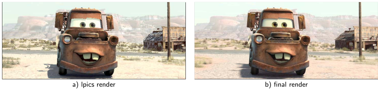
Figure 4: Images rendered using our interactive lighting system (a) compared to the final renderers using RenderMan (b).