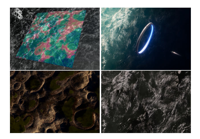
Figure 3: Comparing clouds and terrain in houdini and rendered frames (houdini viewport, final comp, terrain render, and cloud render).

SIGGRAPH '22 Talks, August 07-11, 2022, Vancouver, BC, Canada