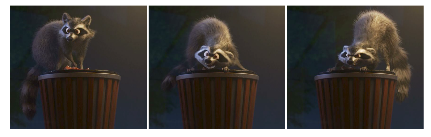
Figure 1: A skin simulation was performed on this fast-moving raccoon during a key fight scene. The kinematic mesh, particularly the hind legs and the torso, contains frequent self-intersections that cause problems with previous approaches.