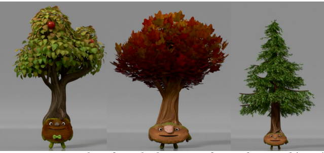
Figure 3: Examples of Earth characters from Elemental (2023) shaded with our stylized bark patterns.

Alexandrina Orzan, Adrien Bousseau, Holger Winnemöller, Pascal Barla, Joëlle Thollot, and David Salesin. 2008. Diffusion Curves: A Vector Representation for Smooth-Shaded Images. ACM Trans. Graph. 27, 3 (2008), 1–8.