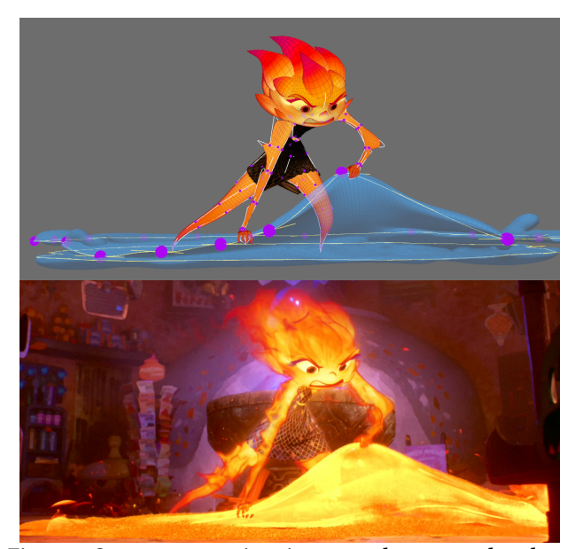
Figure 2: Our curvenet animation controls were used to shape the fire character Ember and a prop molten glass asset. The top image illustrates the deformation generated by Curvenet Adjustments with knots displayed as purple spheres, while the bottom image shows the final render.

To ease the authoring of shaping rigs in Elemental , we designed a new workflow for promoting curvenets into animation controls that bypasses the need of any manual setup. We first enabled the superposition of the Profile Mover deformations on arbitrary rig configurations. To this end, we made a small modification to our